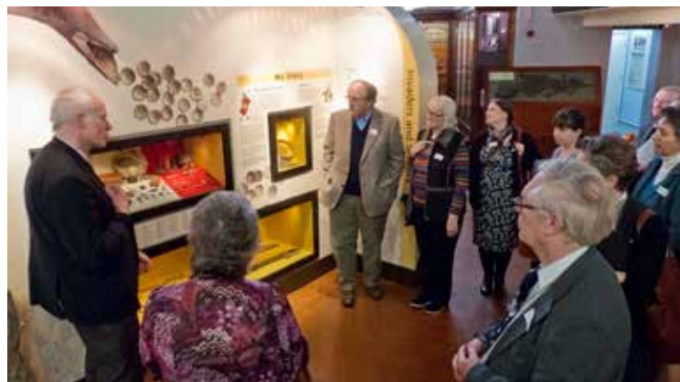
Friends on a visit to Kings Lynn and the Kings Lynn Museum.