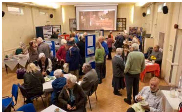
A History Day arranged by the Friends at Cromer Community Hall.