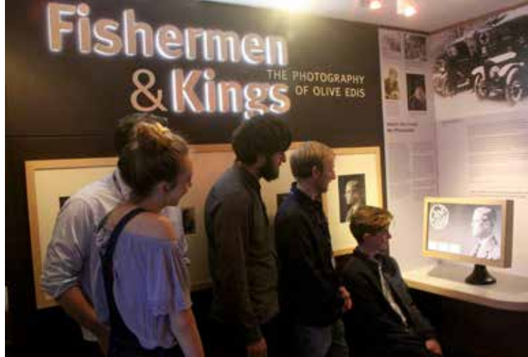
Paston College students view their contribution to the Olive Edis exhibition at the Museum. The Friends made initial grants totalling £5,000 to support the exhibition.

*By supplying your email you agree to the Friends of Cromer Museum contacting you by this method. The Friends of Cromer Museum will keep your email securely and will only use it to supply you with information on activities of the Friends, activities at the Museum and for the administration of your membership.